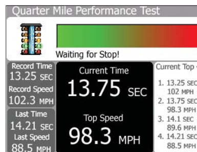
Perform and view 0-60 and Quarter Mile performance tests