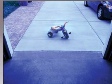
Camera option allows you to see what's behind you and what's not