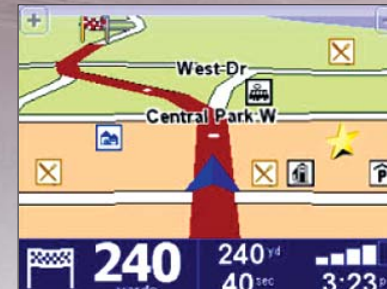
3-D view clearly displays route in easy to follow format